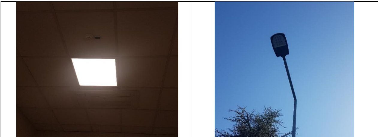
Example of Energy Efficient Appliances Usage: Use of LED lighting and lamps (Gebze Technical University, Turkey)