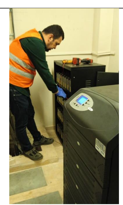
UPS Maintance (Gebze Technical University)