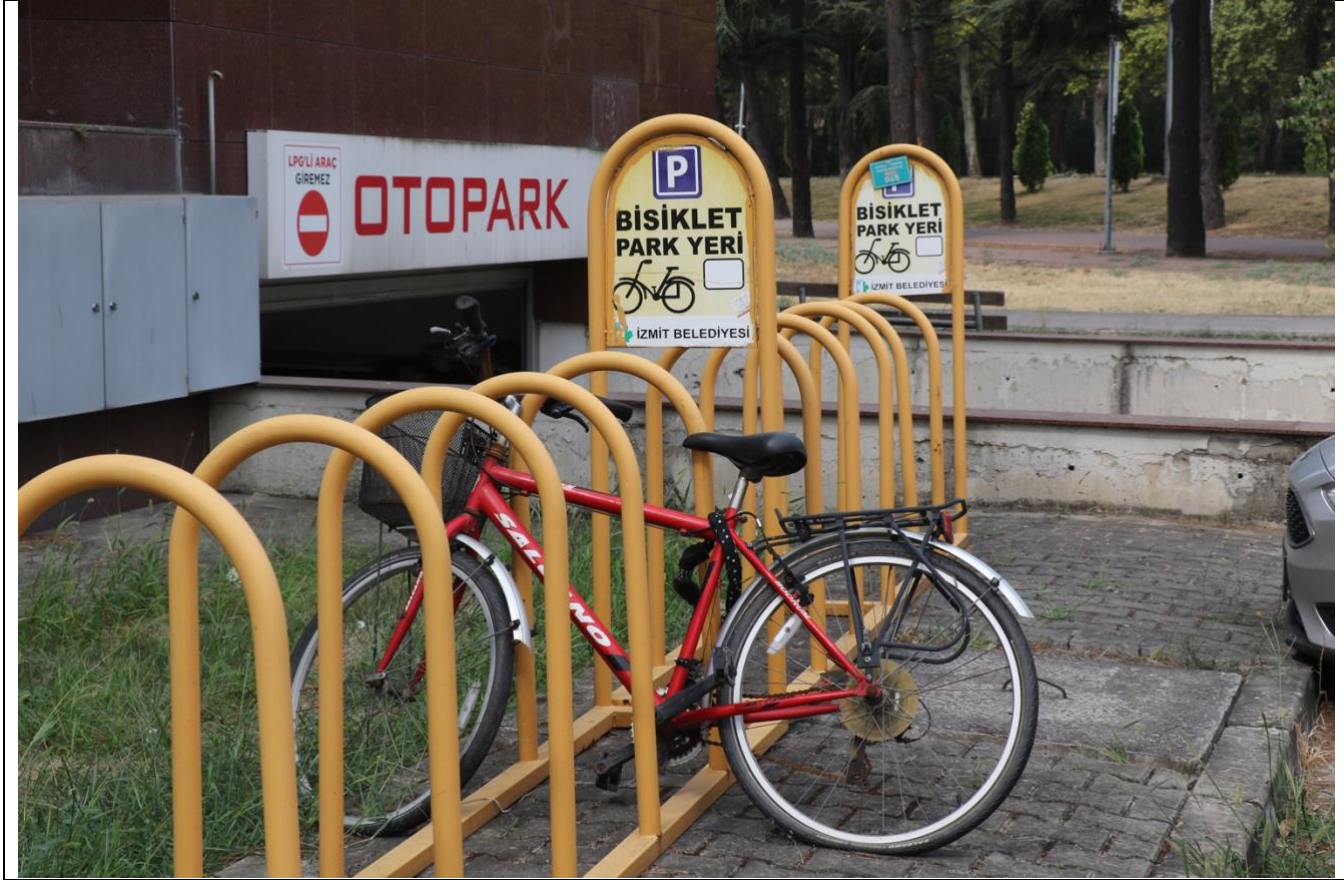
Bike park area

[5.14] Program to limit or decrease the parking area on campus for the last 3 years (from 2018 to 2020)