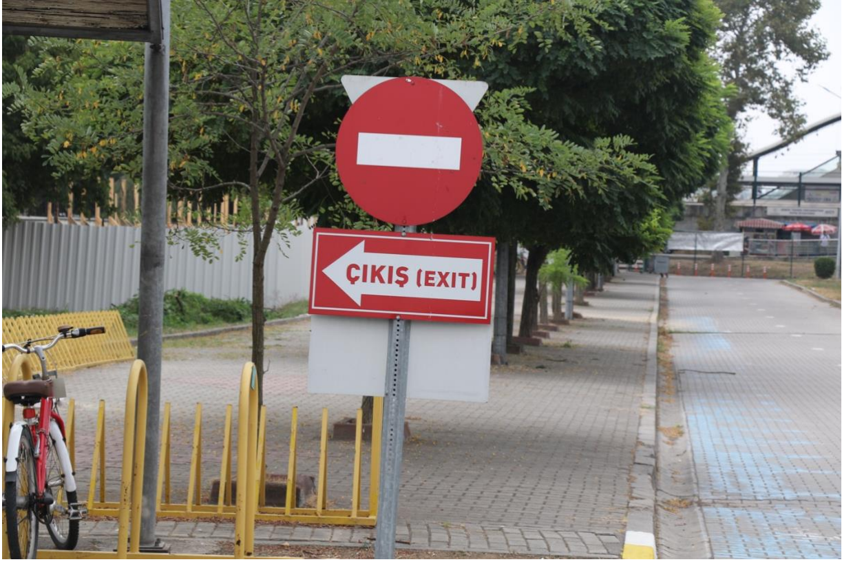
Close area to traffic