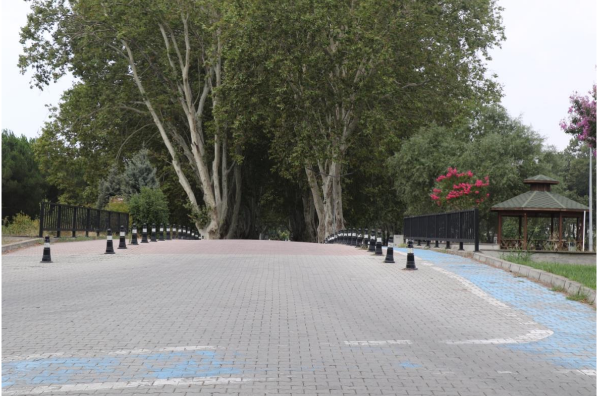
Only pedestrian zone and bike road (restricted area to traffic)