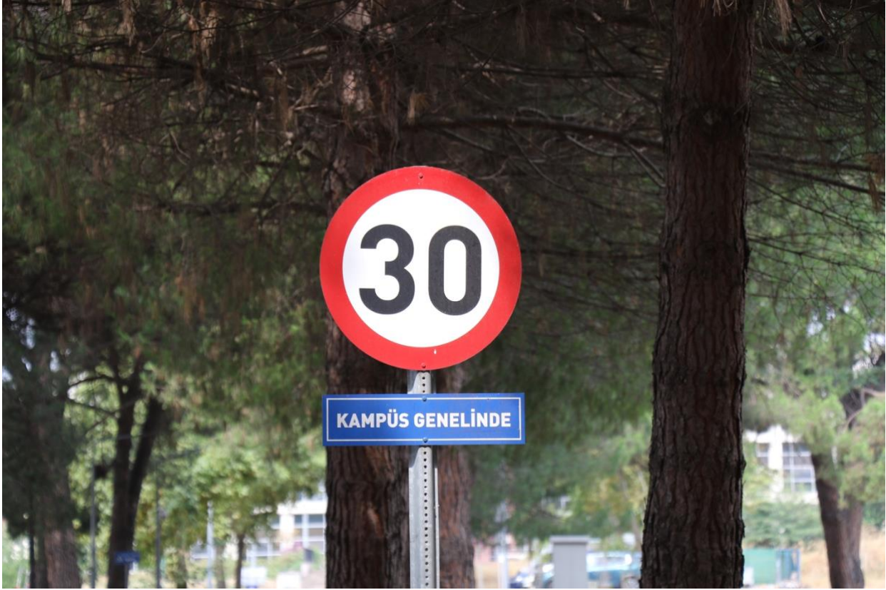
Speed Limit(Warning signs )