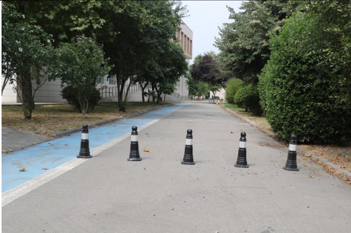
Only pedestrian zone and bike road (close area to traffic)