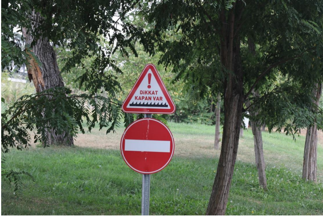
Only pedestrian zone (warning signs)