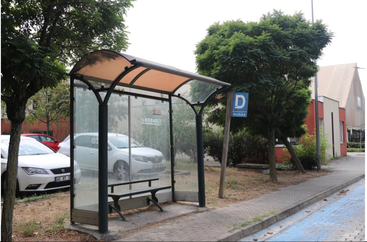
Public transport station near the campus