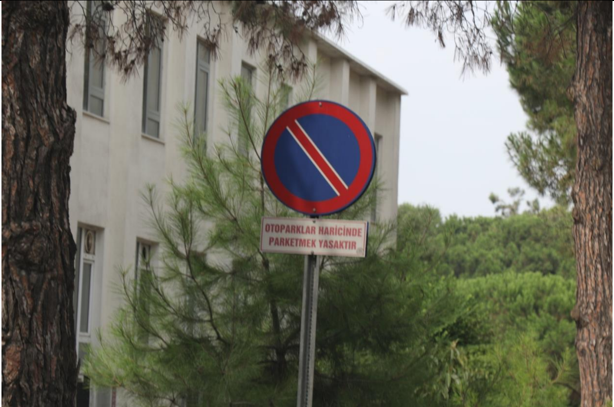
Parking is prohibited except in designated parking areas (warning signs)