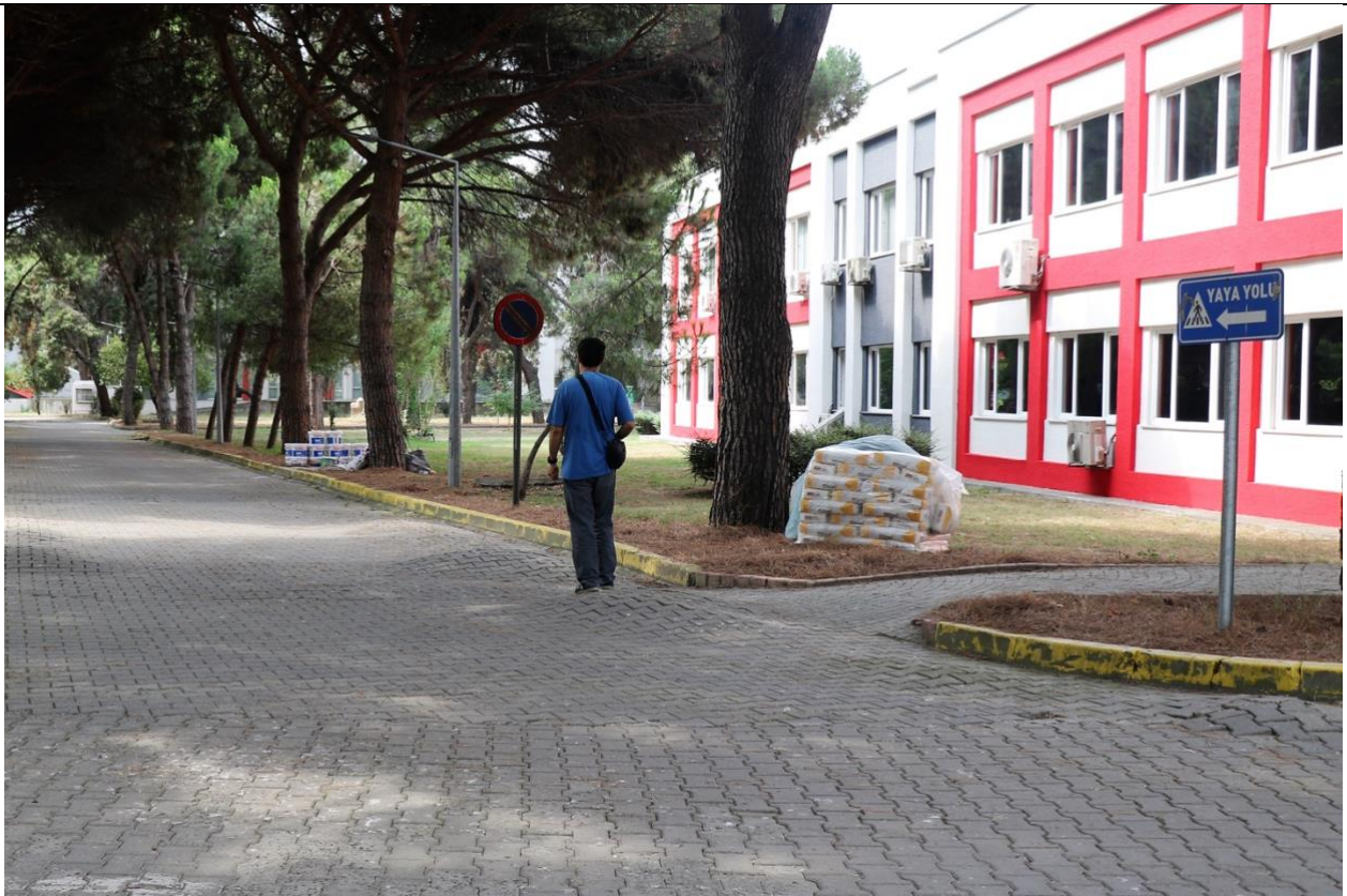
Only pedestrian zone