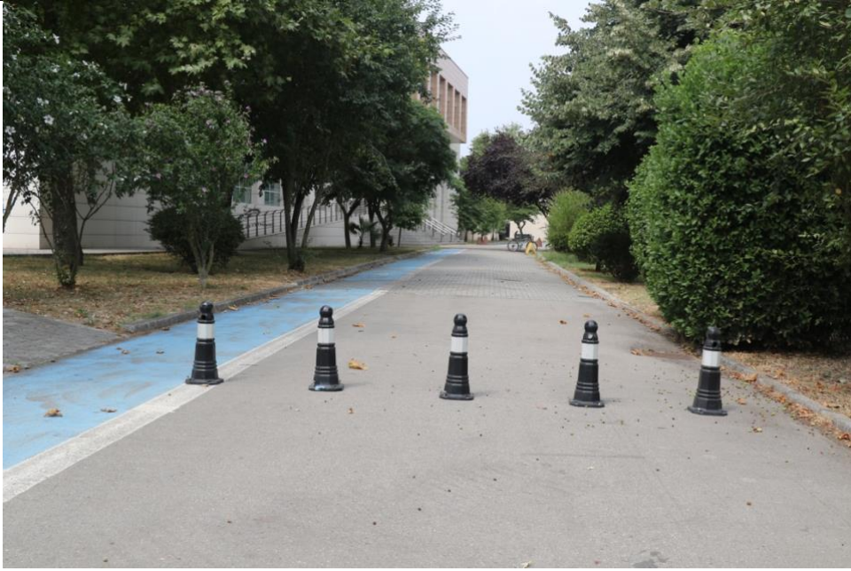
Pedestrian path (close area to traffic)