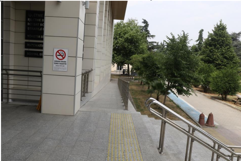
Pedestrian path for disabled pedestrian (faculty buildings entrance)