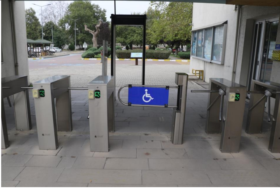
Disabled entrance for disabled pedestrians