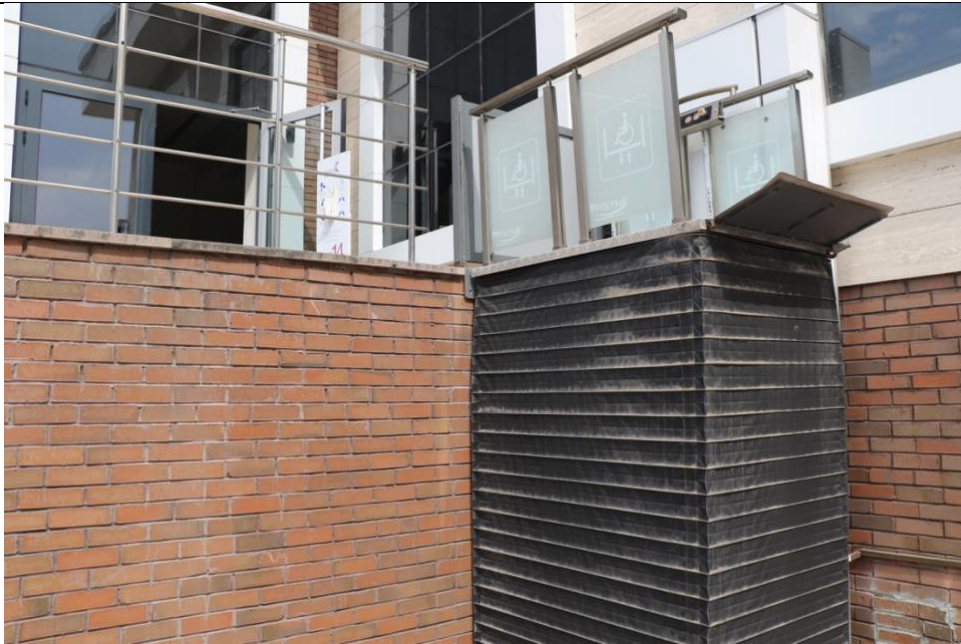
disabled ramp for disabled pedestrians