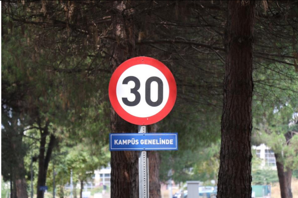
Speed limit (warning signs) for pedestrian security