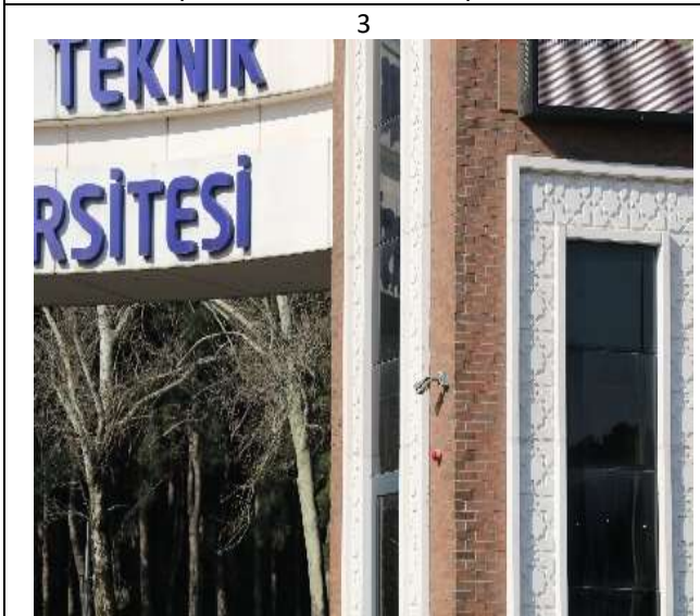
CCTV in entrance of the campus