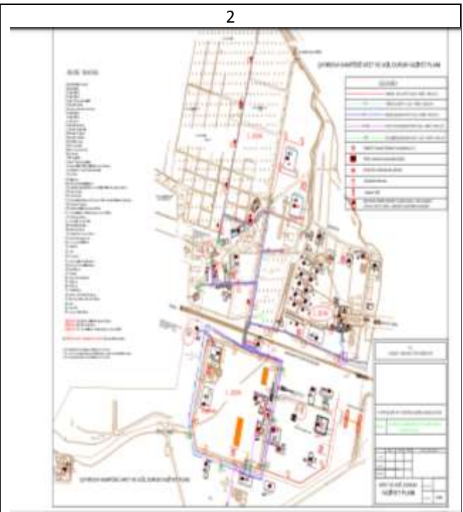
The emergency plan