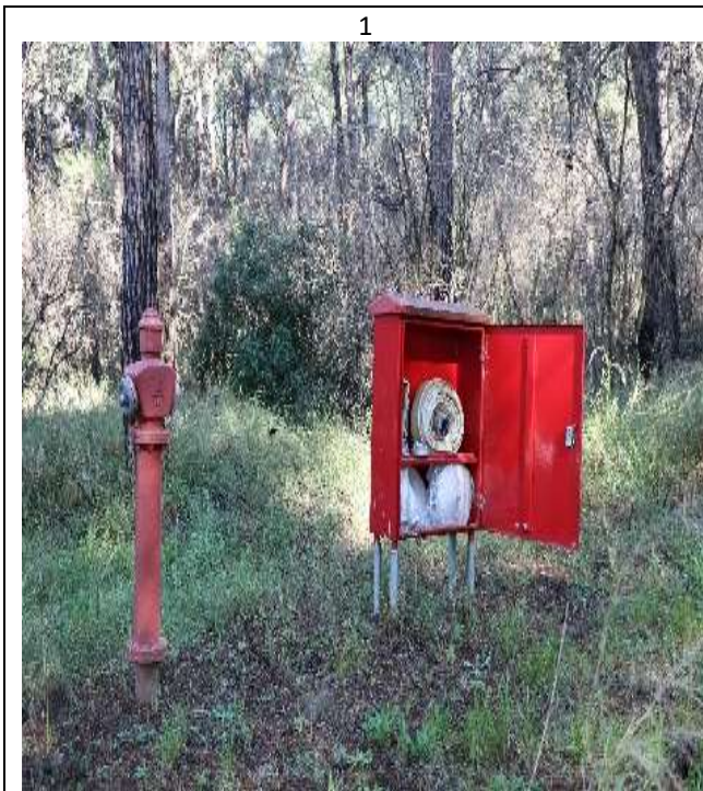
Fire hydrants are located every 150 meters