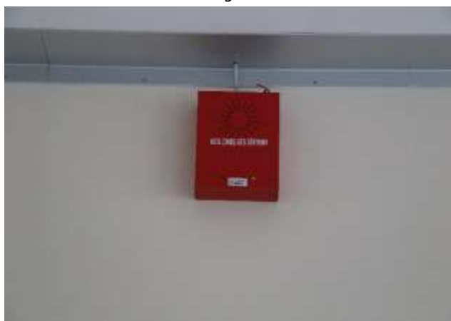
Emergency exit sound system