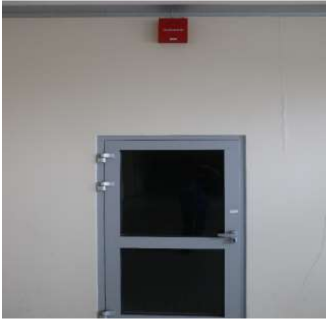
Emergency exit sound system and emergency exit door