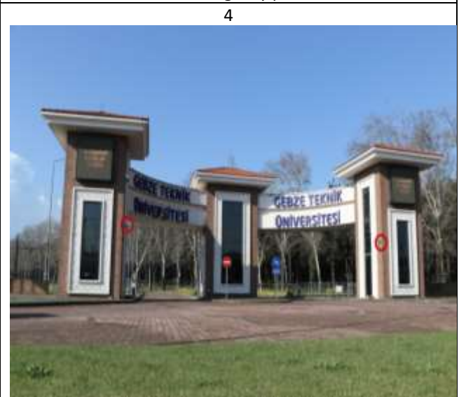
Security cameras seen in the red circles