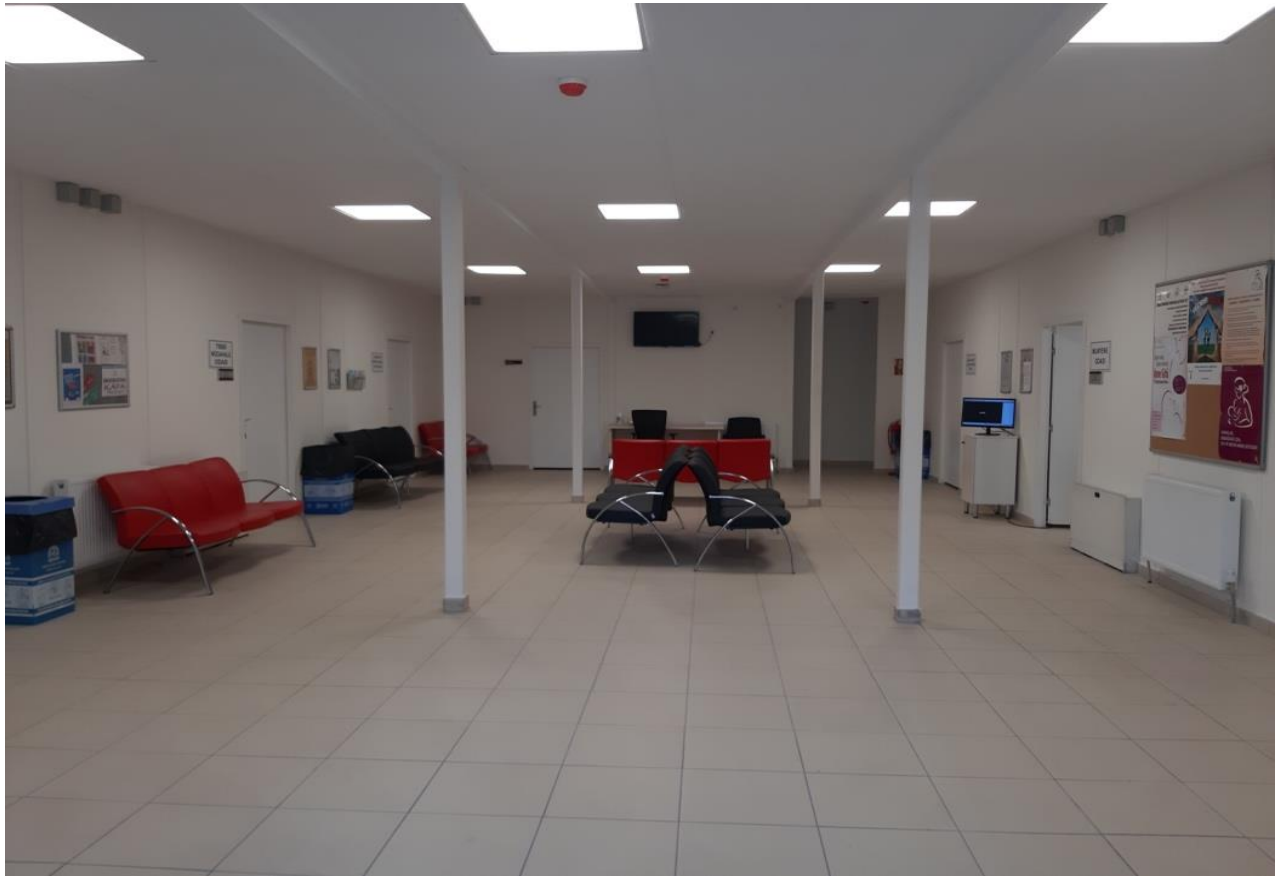
Health center building- overall interior appearance