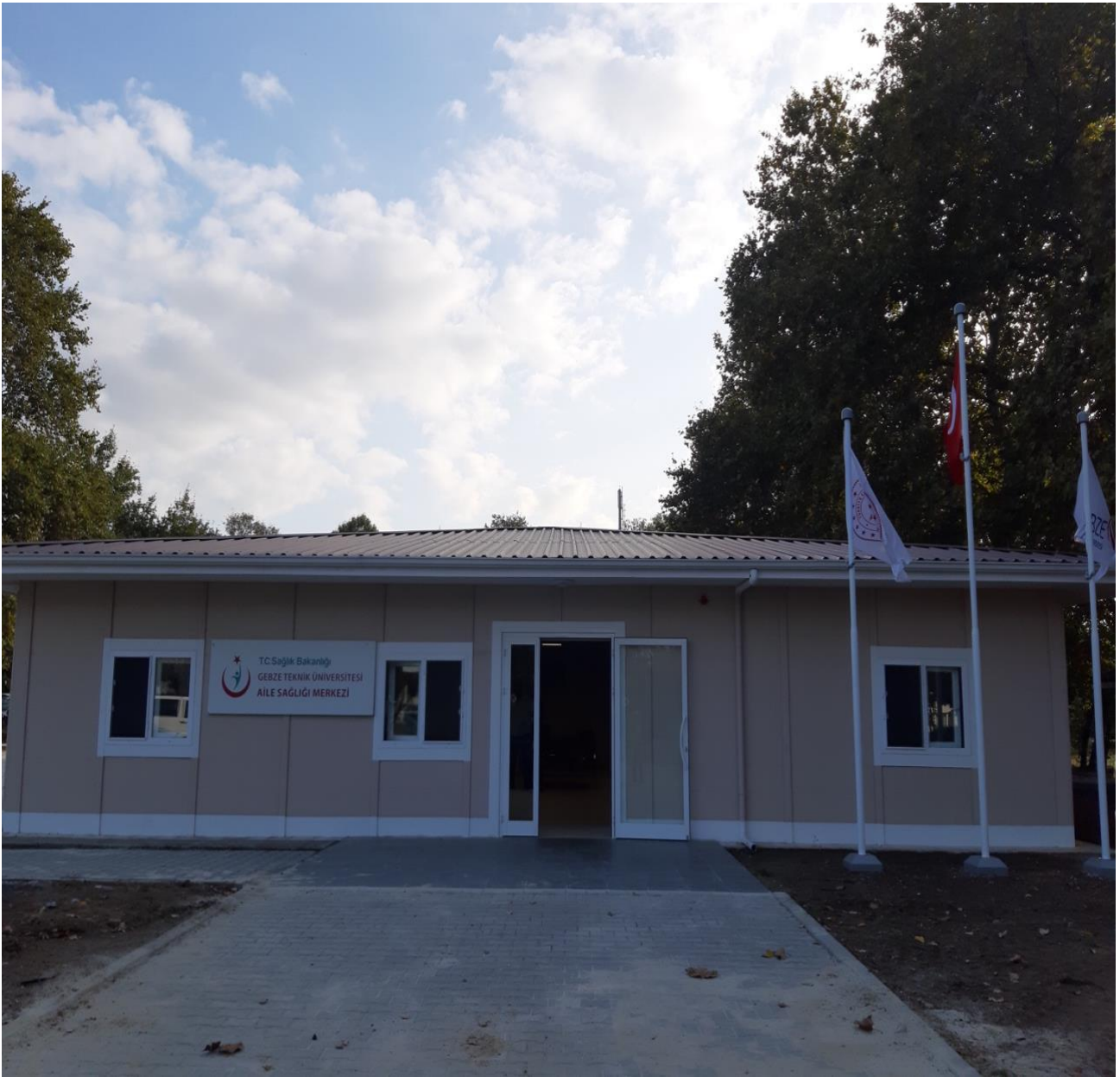
Health center building