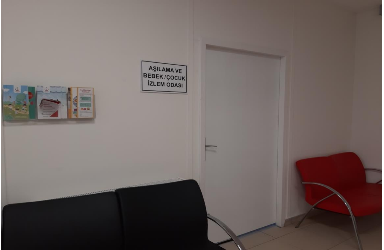
Immunization and pediatric check-up room