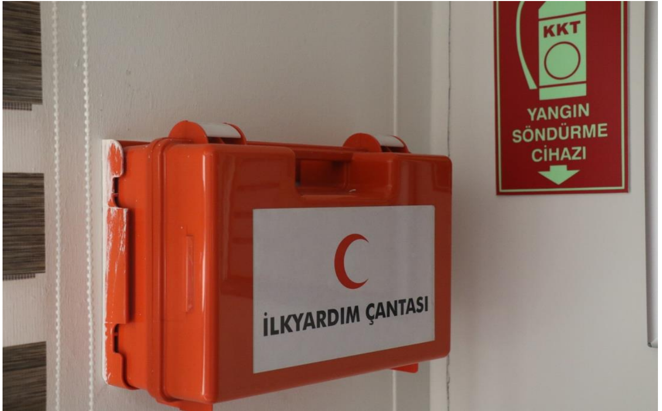
First aid kit

Health infrastructure facilities for students, academics, and administrative staff's wellbeing on GTU (Gebze Technical University, Turkey )