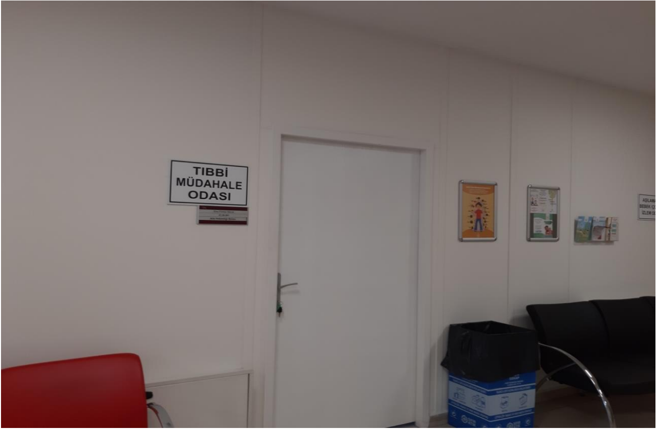
Medical treatment room