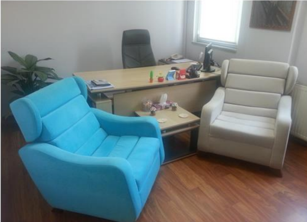
Psychological counseling and guidance services