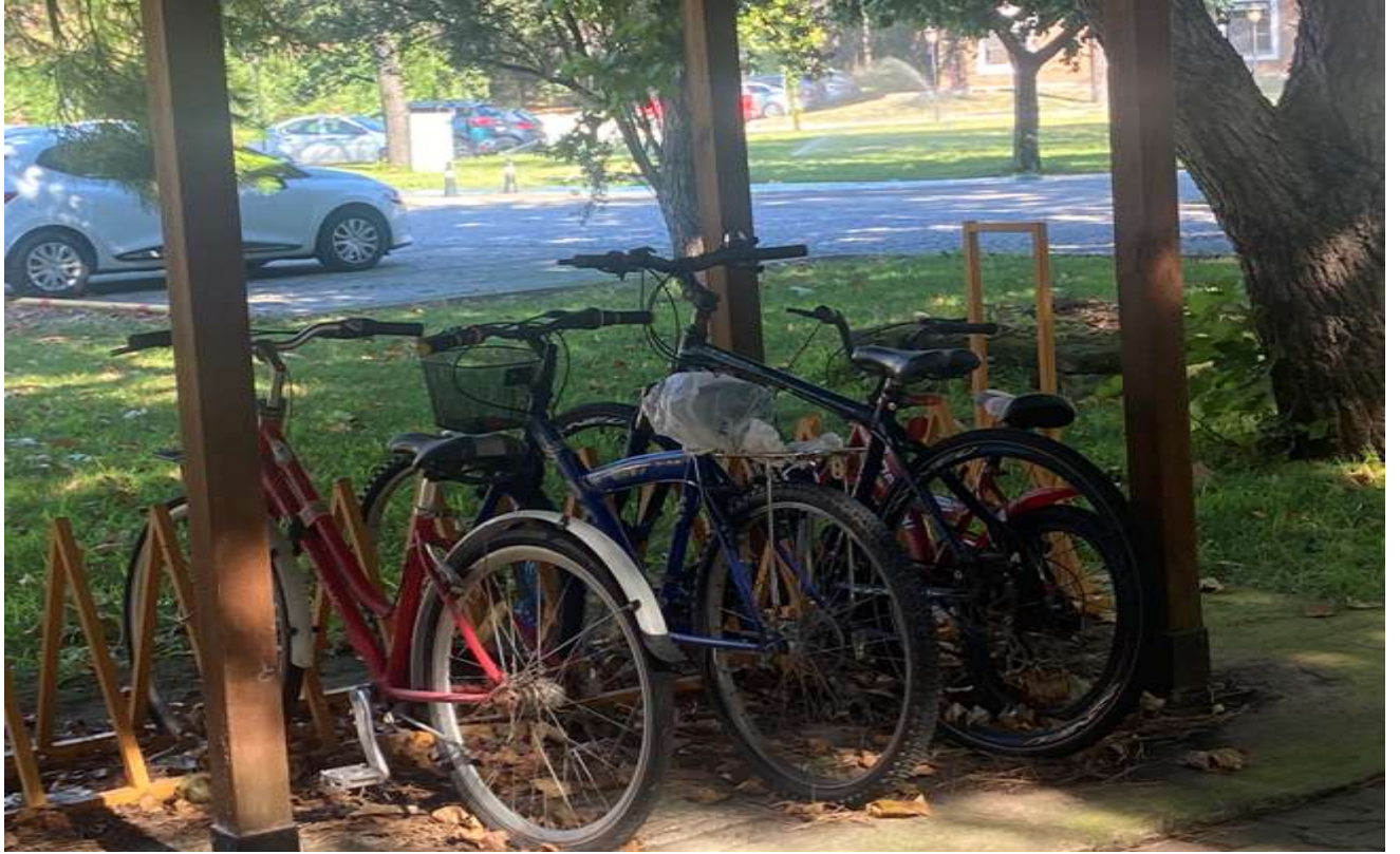
Bicycle Parking Area

Ratio of Parking Area to Total Campus Area (Gebze Technical University,Turkiye)