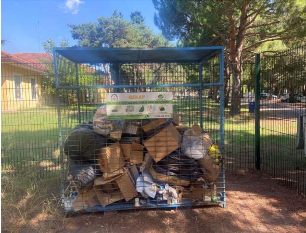
Paper, Plastic, and Cardboard Collection Area